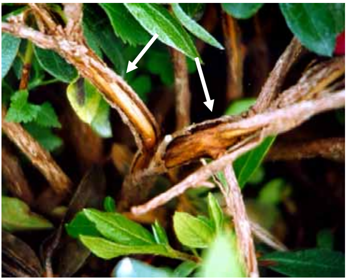
Freeze injury on Indica azalea