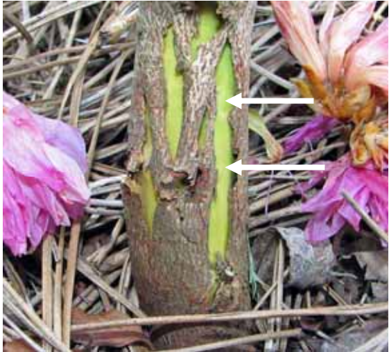
Freeze injury on Azalea 'Orchid Purple' 48 hrs after 18F