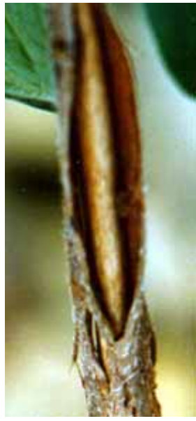
Freeze injury on Indica azalea

Freeze injury on azalea is first manifested by the bark splitting and pulling away from the stem. If this occurs on the main stem, it usually results in the death of the plant. If it occurs on an isolated stem, callus tissue may form around the wound. This callus tissue may look unusual, smooth, or warty. In most instances, plants with damage to the main stem near ground level will have to be replaced.